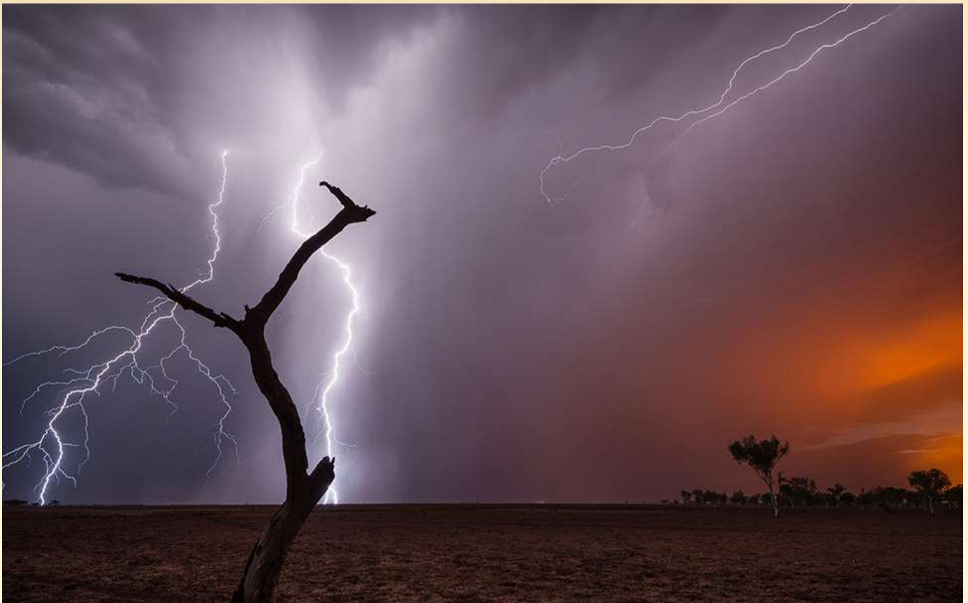
Figure 5: Lightning strikes causing bushfires in Western Australia.

Although many bushfires are accidentally or deliberately ignited by humans, lightning is another major cause. Lightning strikes are the most common natural ignition source for fires and were responsible for igniting the 2003 Canberra fires. A study published in May 2018 linked lightning-ignited fires to rising temperatures in the southern hemisphere (Mariani et al. 2018). Warmer ocean and air temperatures lead to higher evaporation rates and higher humidity, increasing the likelihood of lightning.