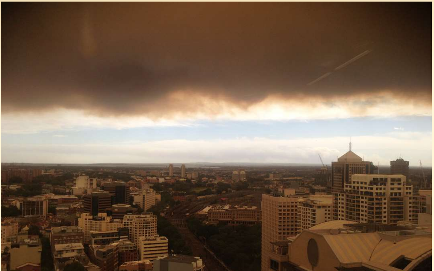
Figure 1: Thick smoke hangs over Sydney during bushfires.

Bushfire smoke can seriously affect health because it contains respiratory irritants as well as inflammatory and cancer-causing chemicals. Smoke can be transported in the atmosphere many kilometres from the fire front, affecting air quality and exposing large populations to its impacts. The estimated annual health costs of bushfire smoke in Sydney are also high, at $8.2 million per annum (2011$) (Deloitte Access Economics 2014).