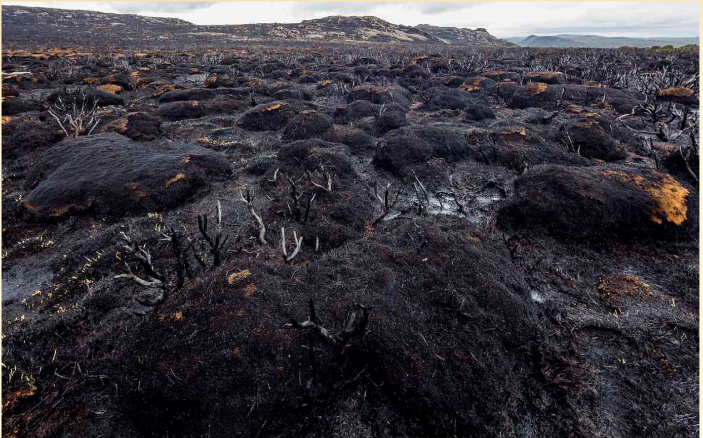
Figure 4: Burnt cushion plants and alpine vegetation, Lake Mackenzie bushfire (2016), Tasmanian Wilderness World Heritage Area.

For example, many eucalypts and wattles are fire resistant and need fire of a certain regularity and intensity to reproduce. But even “fire adapted” species can be disadvantaged or pushed to the verge of local extinction if fires are too intense, or occur too frequently for plants to mature and reproduce. Further, bushfires are now occurring in vegetation types like alpine areas and rainforests that are extremely sensitive to damage. For example, fires in January 2016 occurred in the World Heritage Area alpine vegetation of Tasmania, destroying pencil pines that were over 1,000 years old. Recovery of these areas has been slow to non-existent. The International Union for the Conservation of Nature’s Red List identifies fire as a threat to more than 100 endangered species in Australia due to direct mortality and habitat loss. Animals that survive fires may need to rely on small areas of unburnt land with reduced food supply and increased risk from predators.