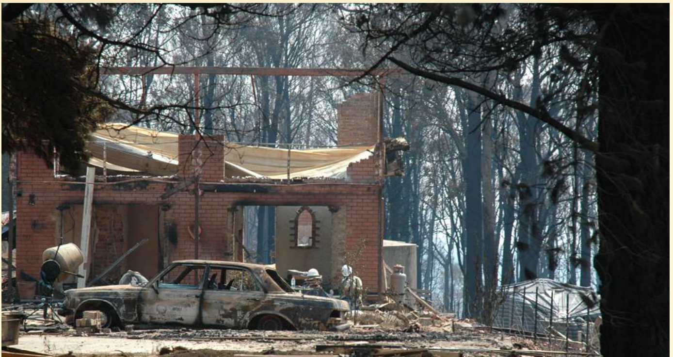
Figure 3: House destroyed from the Black Saturday bushfires in Victoria in 2009.

Having a bushfire preparation plan is extremely important. As climate change contributes to lengthened bushfire seasons and more frequent and extreme bushfire weather, these plans may need to be updated to accommodate increased risks. Relying solely upon previous fire behaviour and experience may not guarantee safety as bushfires become more intense. With lengthening fire seasons, it's also important to be prepared throughout the year.