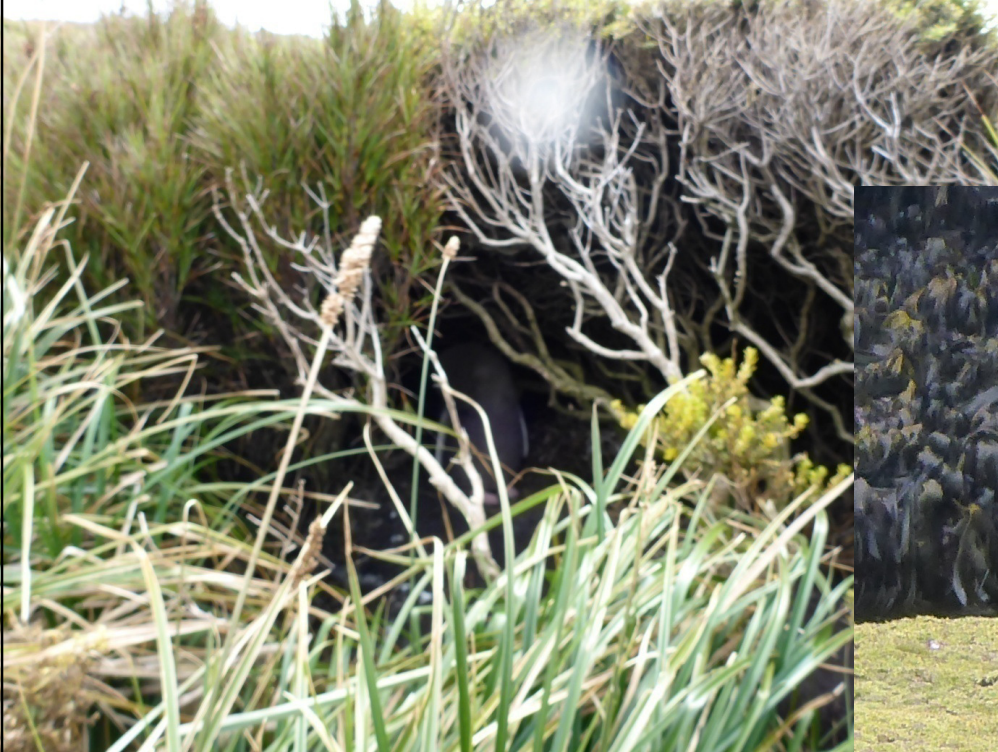
Yellow Eyed Penguin