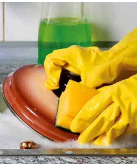
Clean cooking utensils