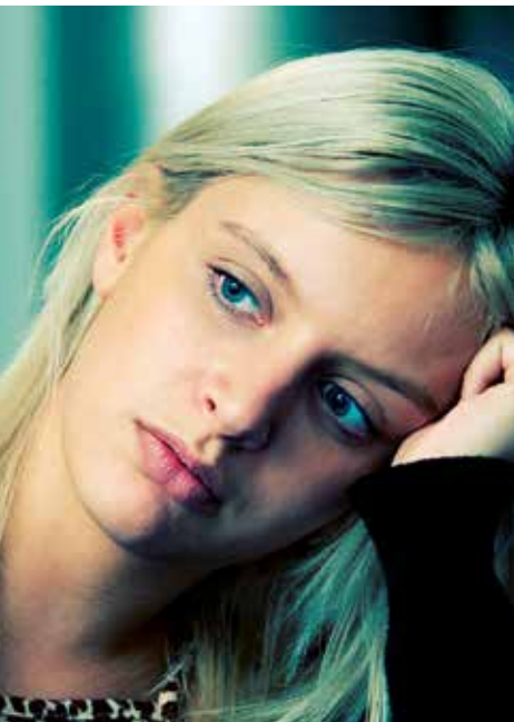
Support is available