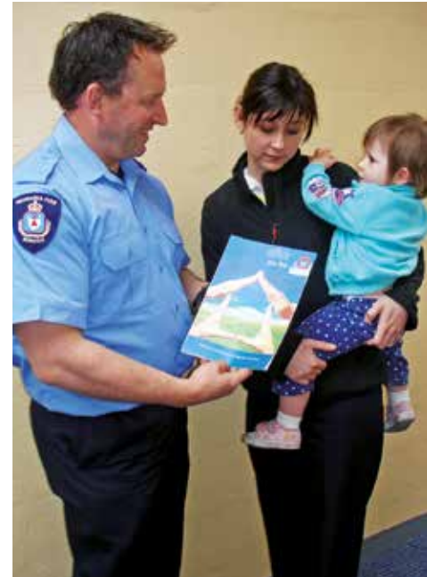
Emergency service officer contact details

community fire safety on freecall 1800 000 699