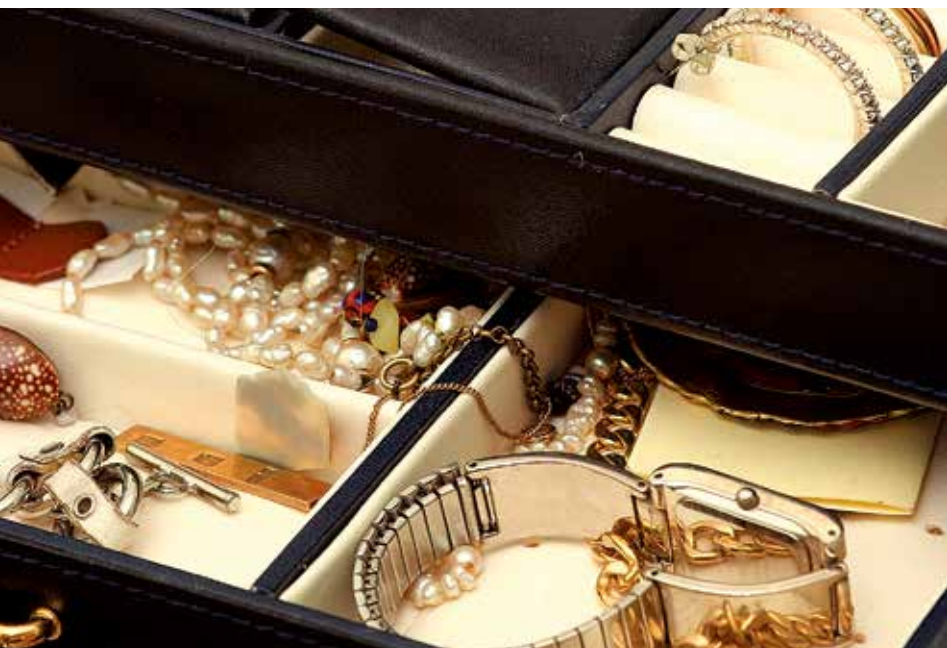
Retrieve personal items such as jewellery