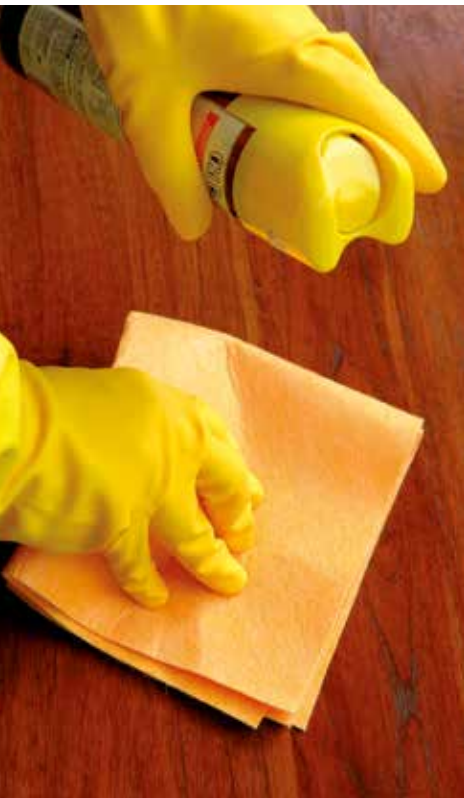
Clean after a fire