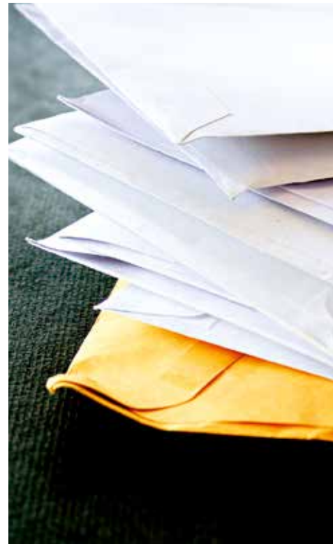
Redirect your mail