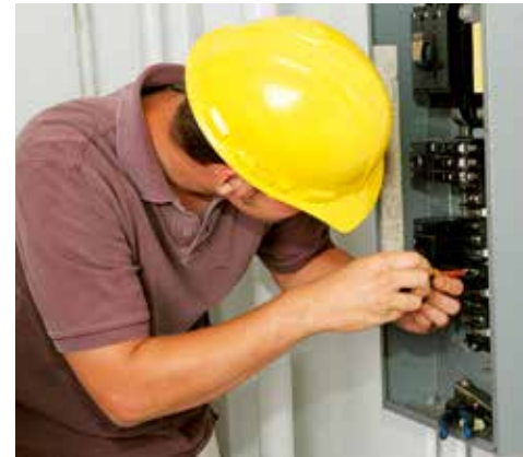
Use qualified tradespersons

Discard any food, beverages, or medicines exposed to heat, smoke or water damage. Refrigerators and freezers left unopened will hold their temperature for a short time, but do not re-freeze frozen food that may have thawed during the incident.