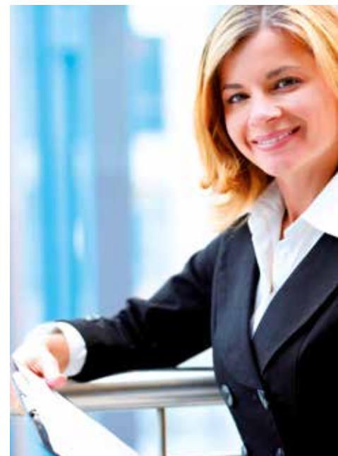
Insurance assessor contact details