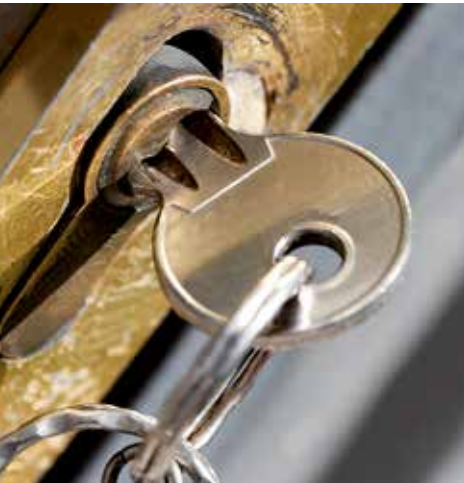
Clean & oil locks