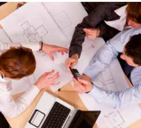
Make a list of damaged property