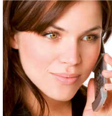
Who needs to be notified?