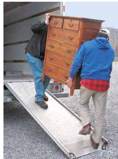
Seek help to relocate