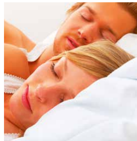
Get plenty of rest

Lifeline (13 11 14) provides confidential 24-hour counselling, support and referral.