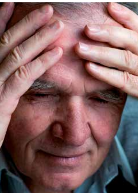
How are you coping?