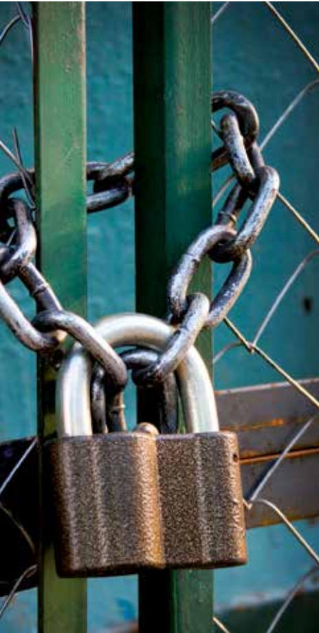
Secure your property