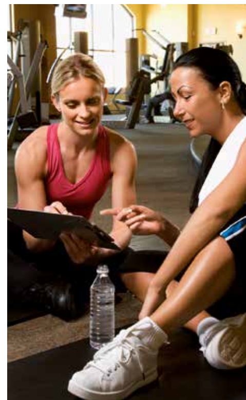
Try to do a little exercise every day