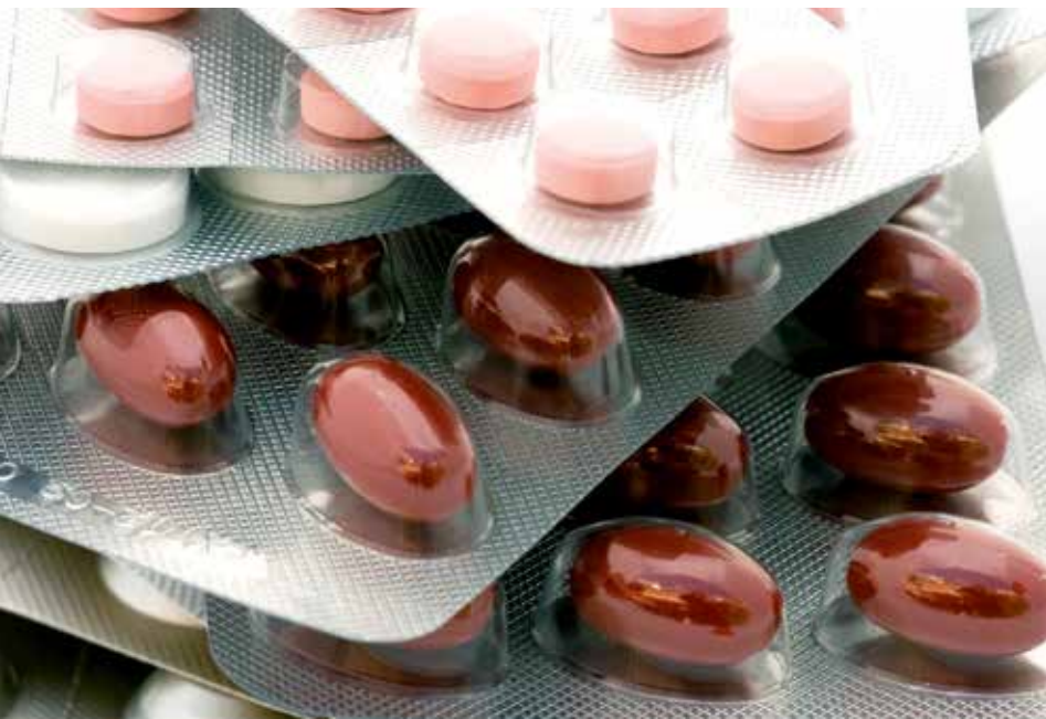
Retrieve medicines that have not been affected by the fire